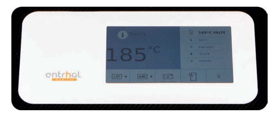
Clear, touchscreen display

DIN EN ISO 11607-2 & Guideline DGSV 2015