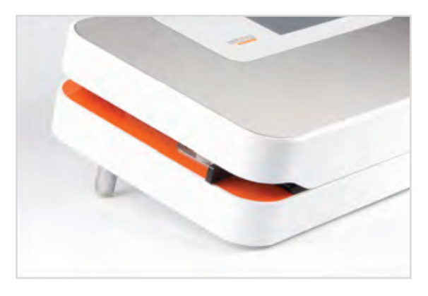
Standard Design: Brushed Stainless Steel with orange side panels