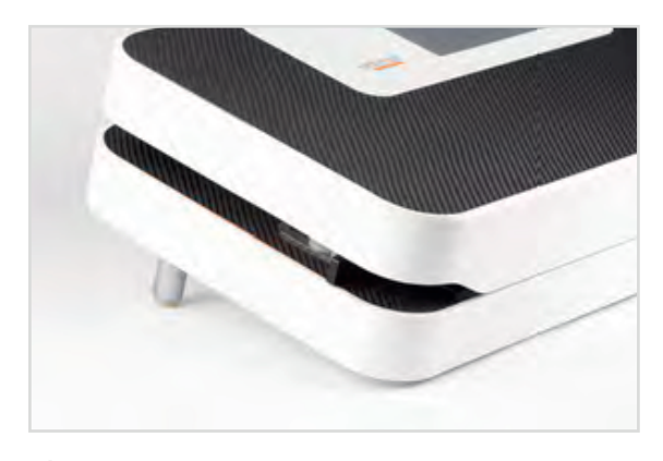
Alternative Design option: Stainless Steel Carbon Black with matching side panels